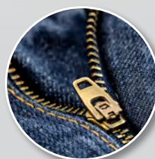
SEWING A ZIPPER