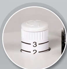
ADJUSTABLE PRESSER FOOT PRESSURE