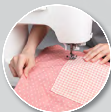
WIDE WORKING SPACE