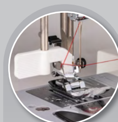
AUTOMATIC NEEDLE THREADER