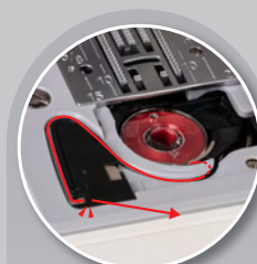
HORIZONTAL DROP-IN BOBBIN SYSTEM