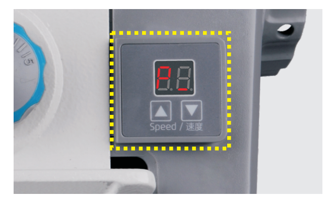
3 Easy and smart panel

Enlarge the sewing range, suitable for various of fabrics like yarn and jeans