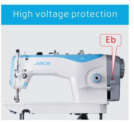
1 Direct drive integration, intelligence